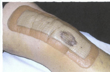
Acceptable amount of fluid