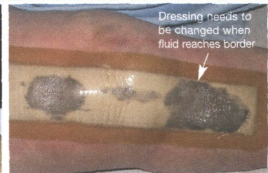
Dressing needs to be changed when fluid reaches border